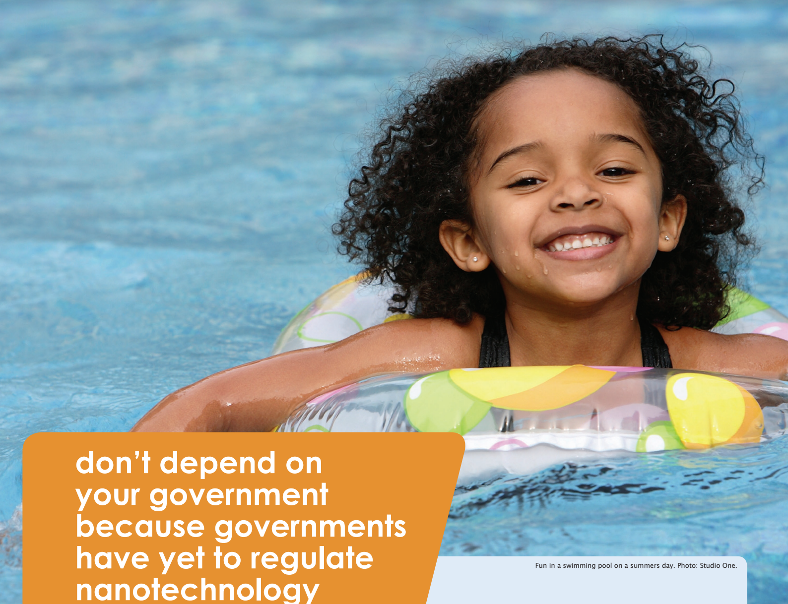
Fun in a swimming pool on a summers day.