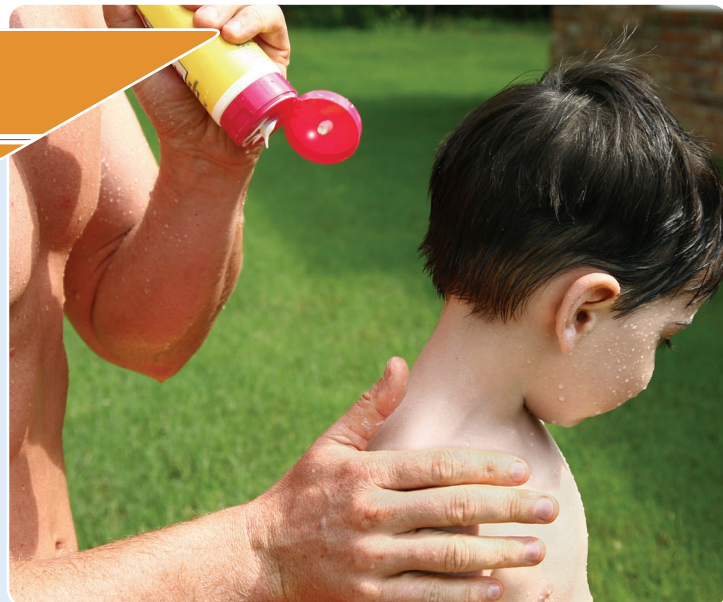
Father rubbing sunscreen into his sons shoulders.

While nanoparticles are invisible to the human eye, their potential health impacts are huge. Materials engineered or manufactured to the nano-scale exhibit different fundamental physical, biological, and chemical properties than bulk materials. One reason for these fundamentally different properties is that a different realm of physics, quantum physics, governs at the nano-scale. But just as the size and chemical characteristics of manufactured nanoparticles can give them exciting properties for manufacturers, those same new properties—tiny size, vastly increased surface area to volume ratio, high reactivity—can also create unique