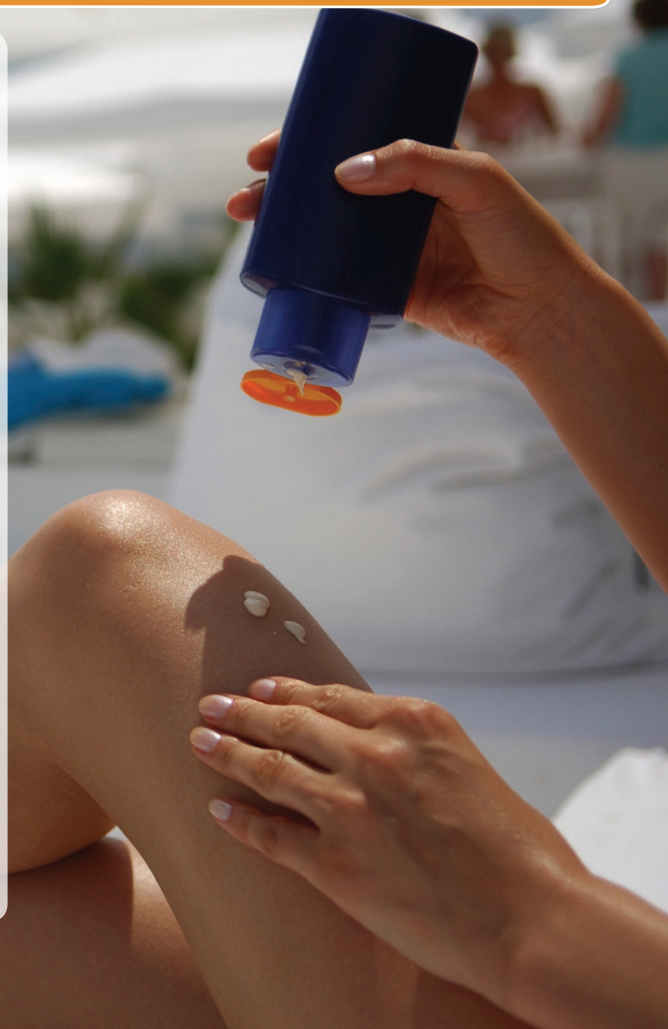
Applying sunscreen at the beach.

Sun worshippers beware. While slathering up with sunscreens to block dangerous ultra-violet (UV) rays you may be exposing yourself to a new danger. Sunscreen manufacturers are adding nanoparticles to sunscreens to make sun-blocking ingredients like titanium dioxide and zinc oxide rub on clear instead of white. These nanoparticles are being added without appropriate labeling or reliable safety information. To cut through the confusion Friends of the Earth asked more than 120 sunscreen manufacturers to describe their companies policies regarding nanotechnology and whether their products contain nanoparticles. Only nine manufacturers said they were selling products that are nanoparticle free, 24 were found to have sunscreen products that contained nanoparticles and 95 brands have policies and ingredients that were unclear or chose to not respond to our survey. This underscores the need for labeling requirements and regulation, and for consumers to pay attention to which sunscreens they wear.