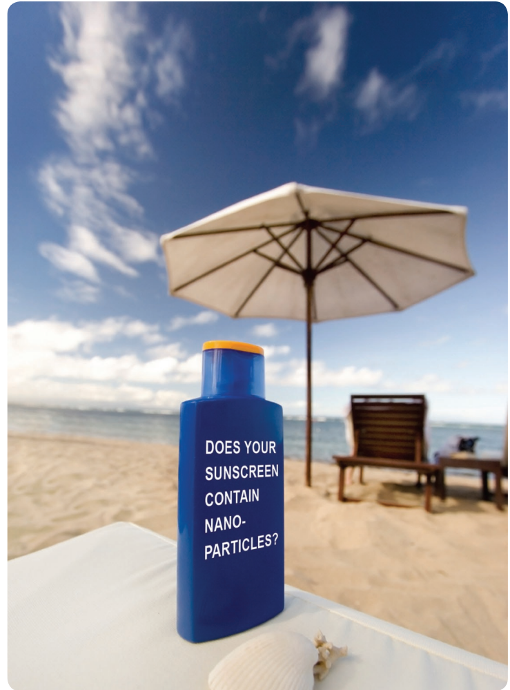
Sunscreen lotion.

This guide can help you choose sunscreen brands to avoid the use of possibly risky nanoparticles. However, remember that protection against the sun's rays cannot be guaranteed by sunscreen alone. There are many non-chemical alternatives to staying safe in the sun, which include: