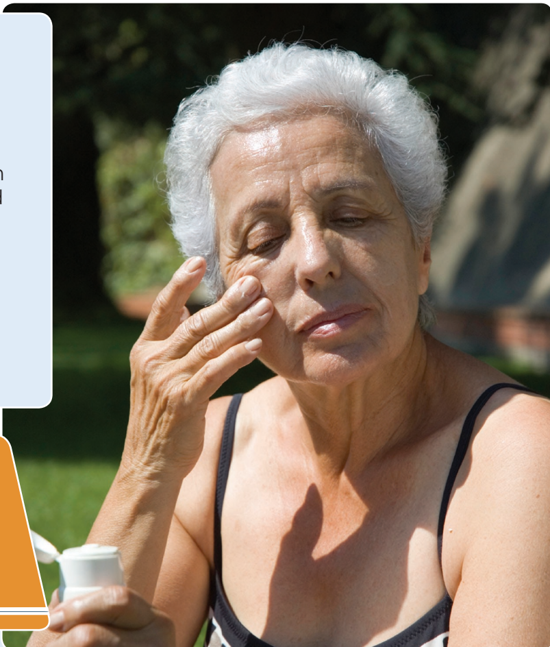
Woman rubbing sunscreen into her face.

Sunscreen manufacturers are increasingly using this unregulated nanotechnology to reduce the size of titanium dioxide (TiO 2 ) and zinc oxide (ZO) (sun-blocking minerals widely used in sunscreens), which makes them clear instead of solid. While perhaps aesthetically preferable, the mostly cosmetic benefits of nanoparticle sunscreen do not outweigh the potential health risks involved in their use.