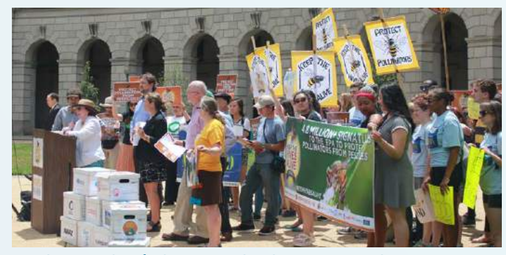
Members stand up for bees at EPA headquarters in Washington, DC.

With you at our side, we can continue to achieve pivotal victories for the Earth and all who call it home no matter the challenges ahead.