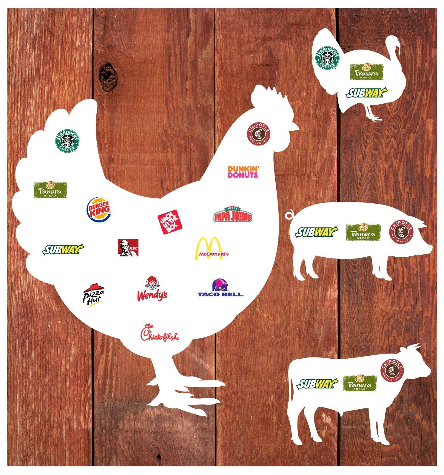
Fourteen of the top 25 restaurant chains have taken action to end routine use of medically important antibiotics in at least some of their chicken supply. But there has been much less progress in turkey, pork and beef.