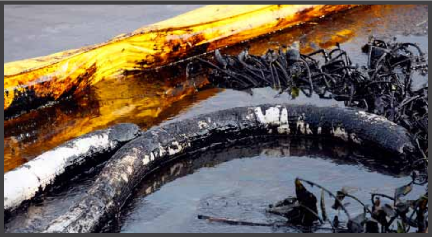
Following the tar sands oil pipeline spill in the Kalamazoo River, crews had to race to keep the oil from reaching Lake Michigan.

temperatures and pressures than conventional crude oil pipelines.