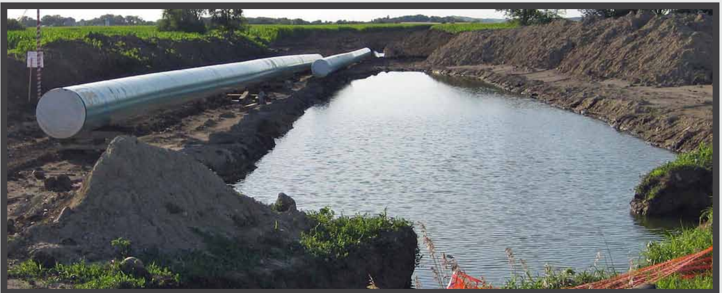
Keystone I pipeline under construction in South Dakota.