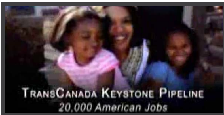
TransCanada's TV ads claim the pipeline will create 20,000 American jobs, but State Department estimates don't match up.

TransCanada, however, has been touting its own analysis that purports to show that job creation would be 13 times higher than State Department estimates, and more than 20 times higher than the State Department's best case estimates for Oklahoma and Texas. The company also makes the rather remarkable claim that almost 30,000 year-long positions would be created in states outside the pipeline's route. 45