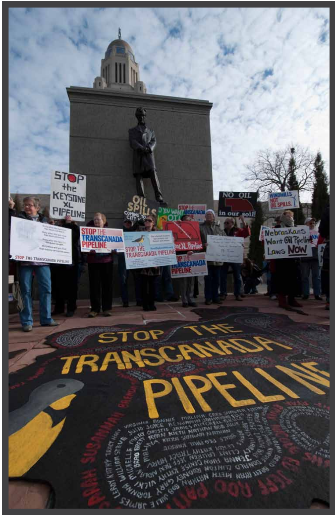
Nebraskans are fighting back against the Keystone XL pipeline.