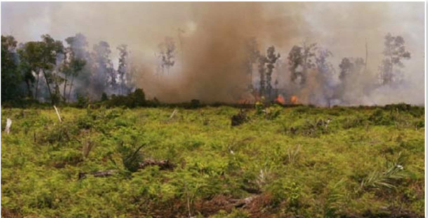
Using fire to clear land for palm oil in Indonesia.

There are serious questions about the justification for donor funding and private investment in the project. Affected communities are demanding the return of land improperly taken, guarantees for the protection of community land rights, compensation for crop damage, and