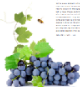
TABLE GRAPES ARE A VERSATILE FRUIT THAT CAN BE ENJOYED IN MANY WAYS. THIS CHALLENGE EXPLORES THE HISTORY AND CULTURE OF TABLE GRAPES AND THE ROLE OF SCHOOL GARDENS IN SUPPORTING THEIR PRODUCTION.