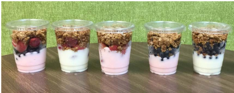
Fruit & Yogurt Parfait