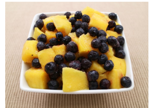
Mango Berry Blast