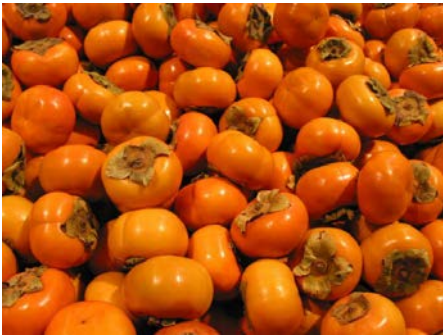
Harvest of the Month