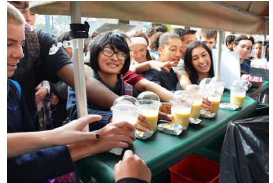
Seeking Student Input – Test Kitchens