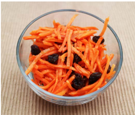
Carrot Raisin Salad