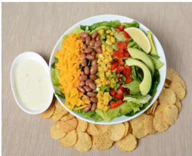
Ava's Avocado Salad