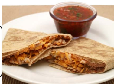
Seeking Student Input – Kid's Create Recipe Contest