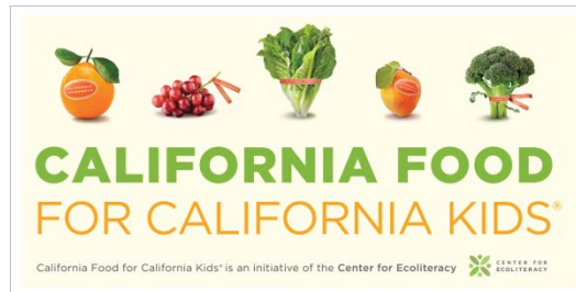
Working with Community Partners – Program Innovation