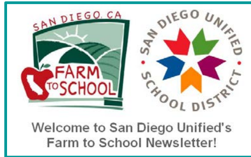
Farm to School Newsletter