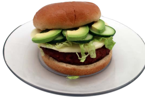
California Veggie Burger