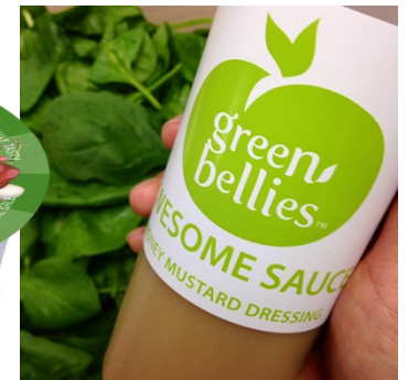
Collaborating with Vendors – Product Development