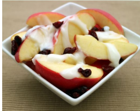
Cran Apple Delight