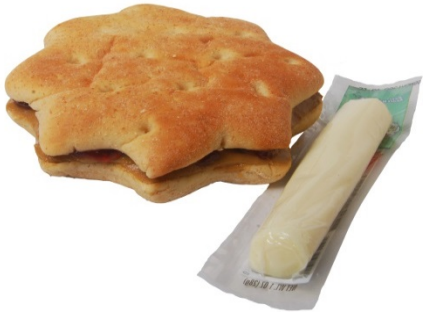
Sunbutter & Jelly Sandwich w/ String Cheese