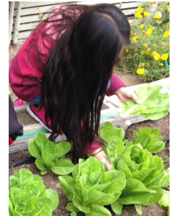
Garden to Café