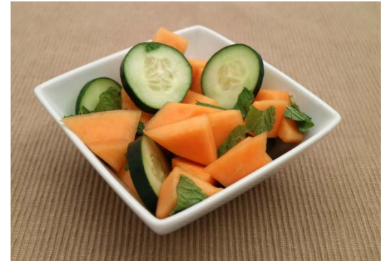
Minty Melon Sensation