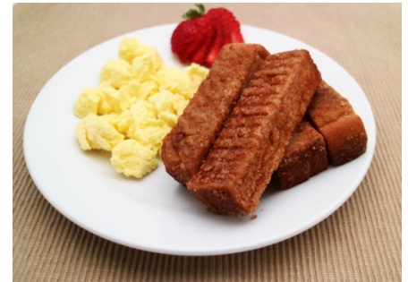
Scrambled Eggs & French Toast