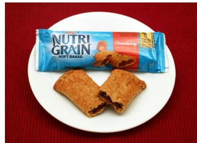
Strawberry NutriGrain Bar