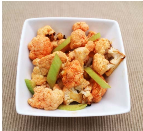
Buffalo Cauliflower Salad