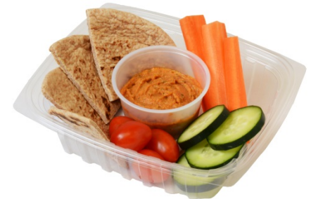
Baja Hummus Veggie Plate