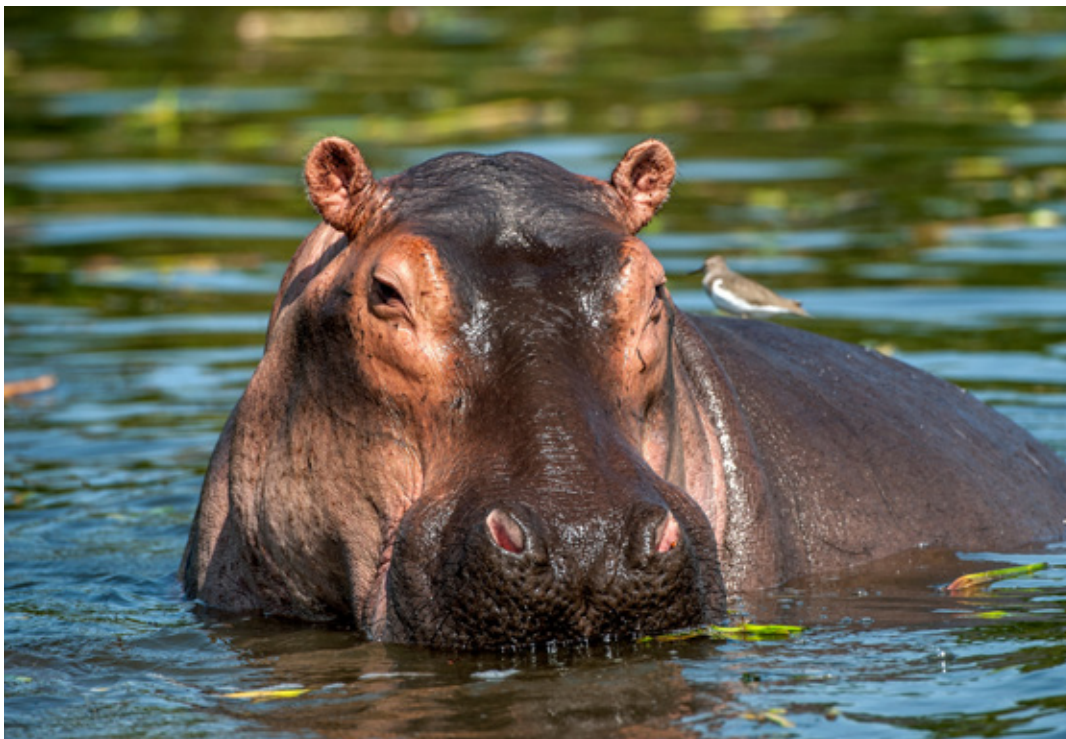
The Koukoutamba Dam would partially flood the Moyen Bafing National Park and degrade or destroy the habitats of the hippopotamus, a Vulnerable Species, according to the IUCN's Red List.

This example shows how promises of protecting the area in perpetuity may instead only last a few years, as host country governments may renege on such commitments.