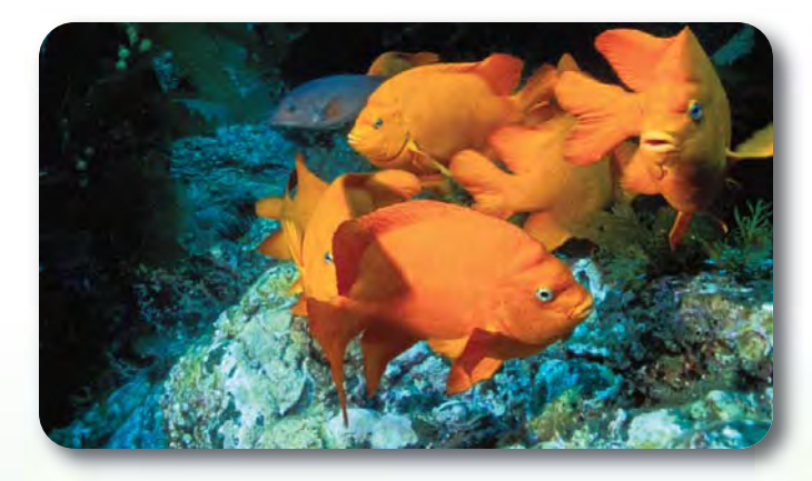
Garibaldi swim through a forest of kelp in the Channel Islands National Marine Sanctuary and National Park.

risk and prevent 3,600 premature deaths between 2009 and 2015.