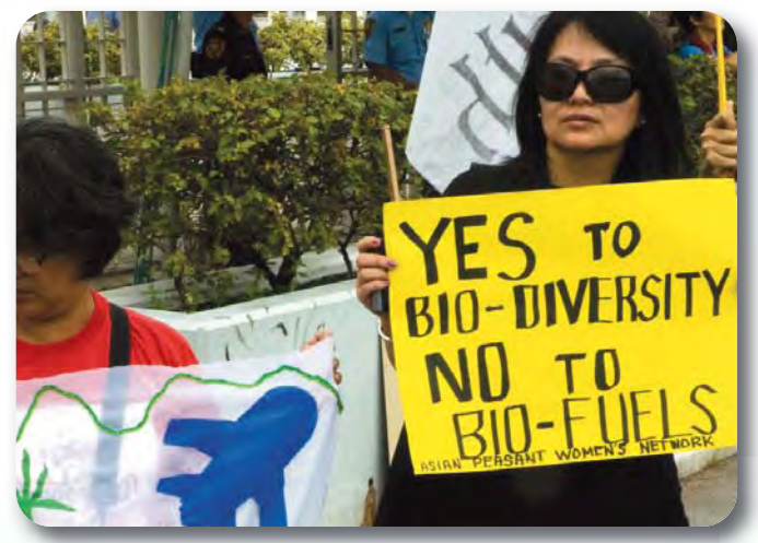
Activist draws attention to the biofuels threat at a climate justice mobilization during climate talks in Bangkok.

The House climate bill would reward the dirty coal industry with billions of dollars in giveaways — and undermine our power to regulate its pollution under the Clean Air Act.